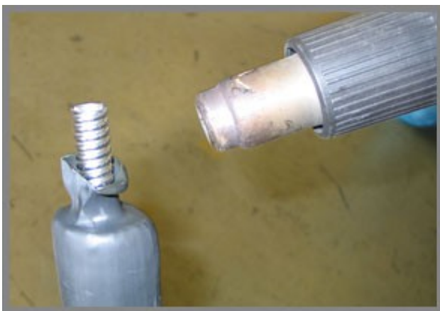
shrink with hot air