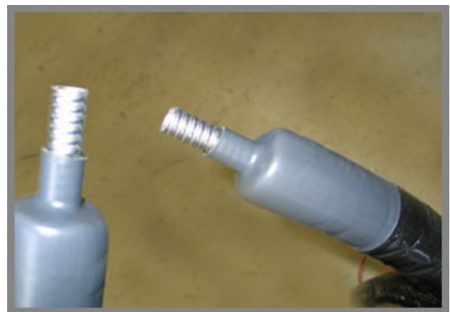
heat shrink tube adapted