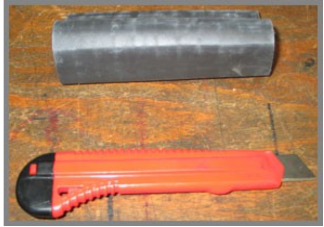
cut shrink tube